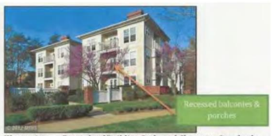
Illustration - Example of Building Scale and Character Standards

Illustration 3 Wall offsets & changes In façade colors & materials