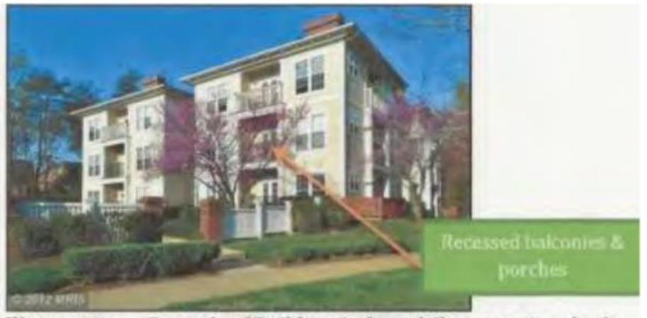
Illustration - Example of Building Scale and Character Standards