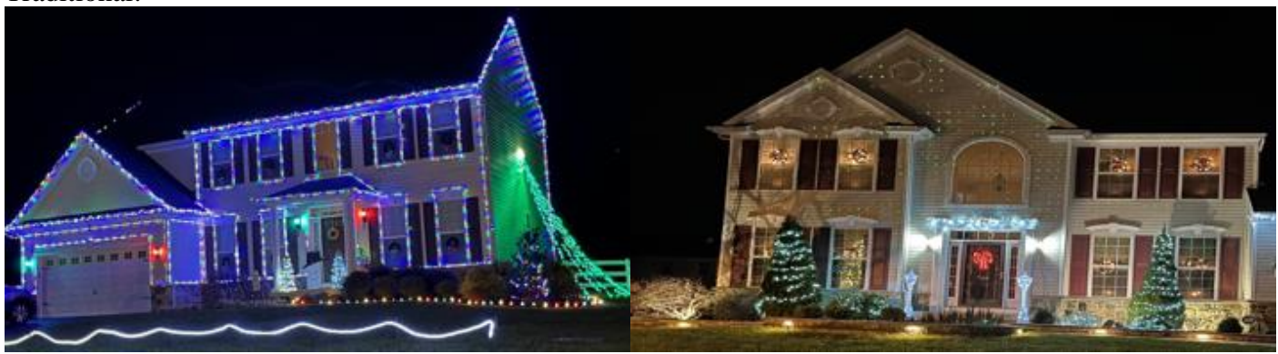
1st Place 221 Edgar Road