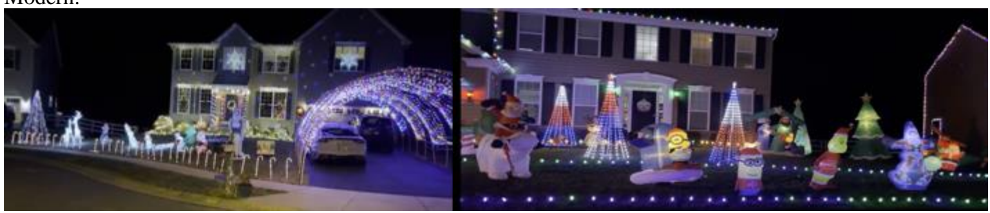
1st Place 1110 E Founds Street