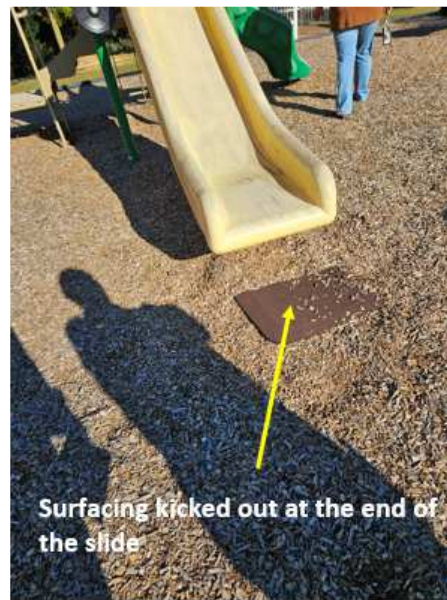
TP 2 Surfacing at slide ends