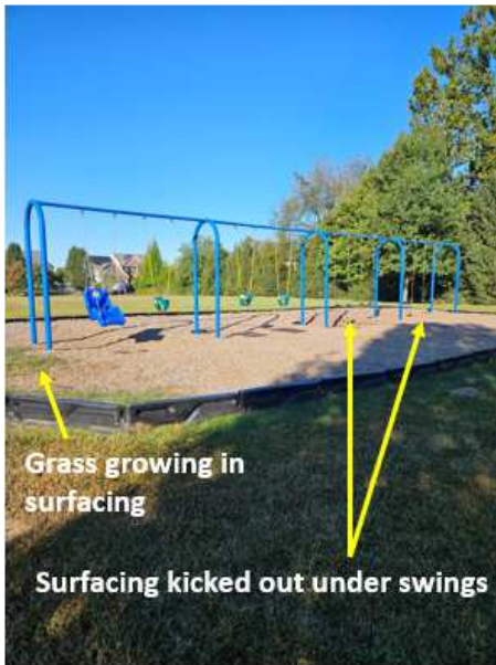
TP 1 Surfacing issues under swings