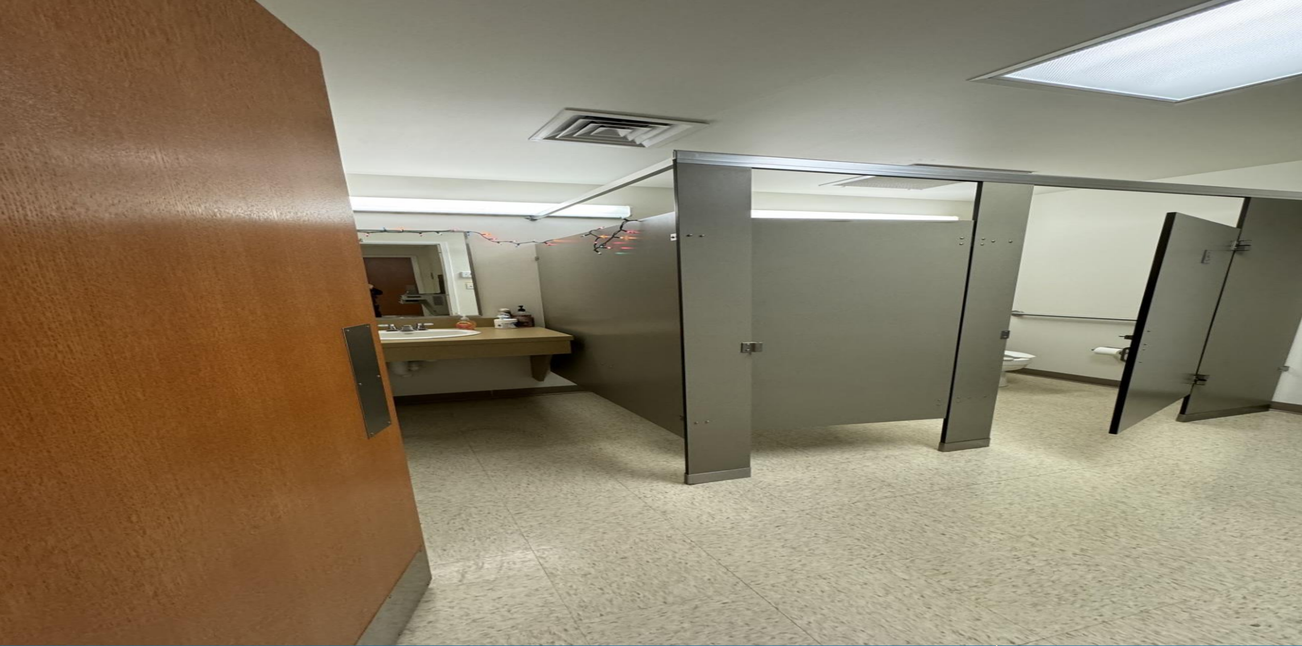
LOCKER ROOM / RESTROOM (1)